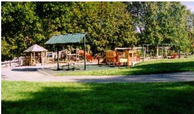
table that is accessible on both ends and that has a roof over it to provide shade.

4) There are logistics to putting in a play ground that make the project time-consuming, but which are not obvious to the eye. We needed to have an engineering plan and to design a retaining wall for dirt that was moved around the 4,000 square foot space. We needed to install cache basins and water drainage wells. We needed to pass the Conservation Commission's guidelines concerning water drainage and a nearby brook. We had to present to a Parks and Recreation Commission to get final approval on our design plan. There were countless meetings about equipment choice and placement, and we had numerous meetings with the City to ensure that safety standards were met.